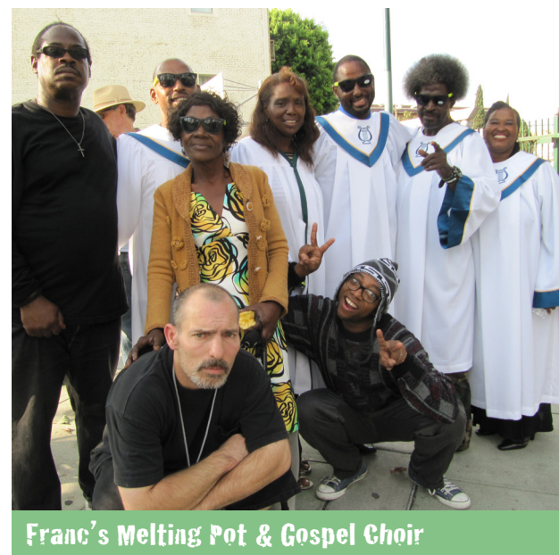
Franc’s Melting Pot & Gospel Choir