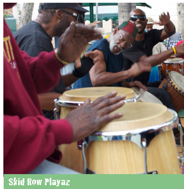
Skid Row Playaz